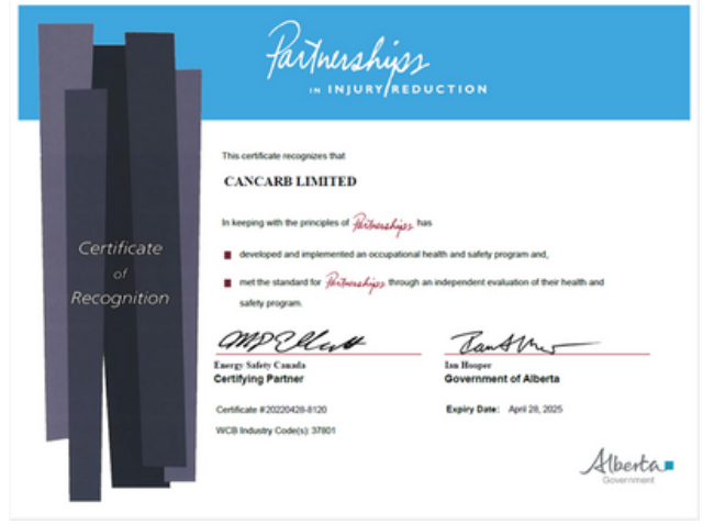
Figure 3. Energy Safety Canada Certificate of Recognition for Health and Safety