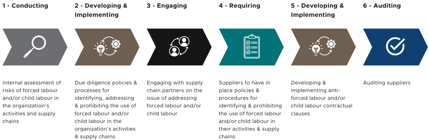
Figure 1: Multi-Step Process to Identify and Reduce the Risk of Forced and Child Labour

The review of the sector identified potential risks associated with sourcing Chinese PVC, a key ingredient in vinyl production. The audit led to the prioritization of the actions noted in the governance section point 3(b). Where shortfalls in policies and documentation were identified, recommendations were made regarding corrective actions and follow-up during the first half of 2025. The results of those measures will be reported on in TORLYS 2025 report.